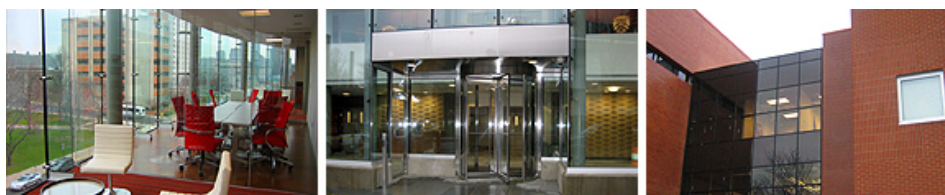
(l. to rt.) - 4th floor Dean's suite; front entrance; new Law Library facade.