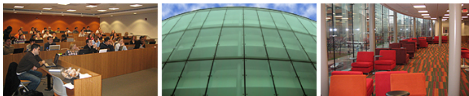
(l. to rt.) - typical classroom in new building; 4-storey bay windows; Law Library gallery.