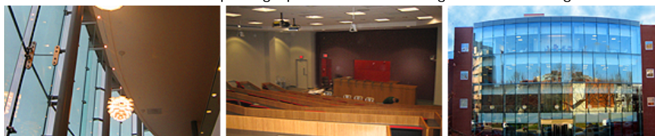
(l. to rt.) - lobby of new Law School building; moot court room; front of building at mid-day.

Below: Selected photographs of the new College of Law building.