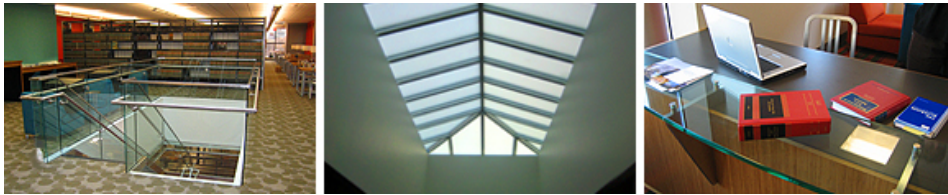
(l. to rt.) 3rd floor Law Library; skylight over Library stairway; reference desk in Library.