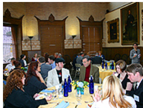
Accepted Students fill the Peck Center as the day's schedule is highlighted.