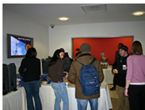
A continental breakfast was served to all who visited. Hot drinks were especially appreciated on such a cold March day!