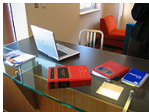
March 5, 2007 - the Drexel Law Library opens! Above is the Reference desk on the third floor of the new Law Library.

The Drexel College of Law Library held a morning reception complete with tours of the new two-storey Law Library complex. Students from Drexel Law and visitors from across campus came to check out the space and enjoy a continental breakfast served.