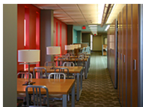
Third floor student study bays beside the compact shelving with printed editions of federal and state case law.